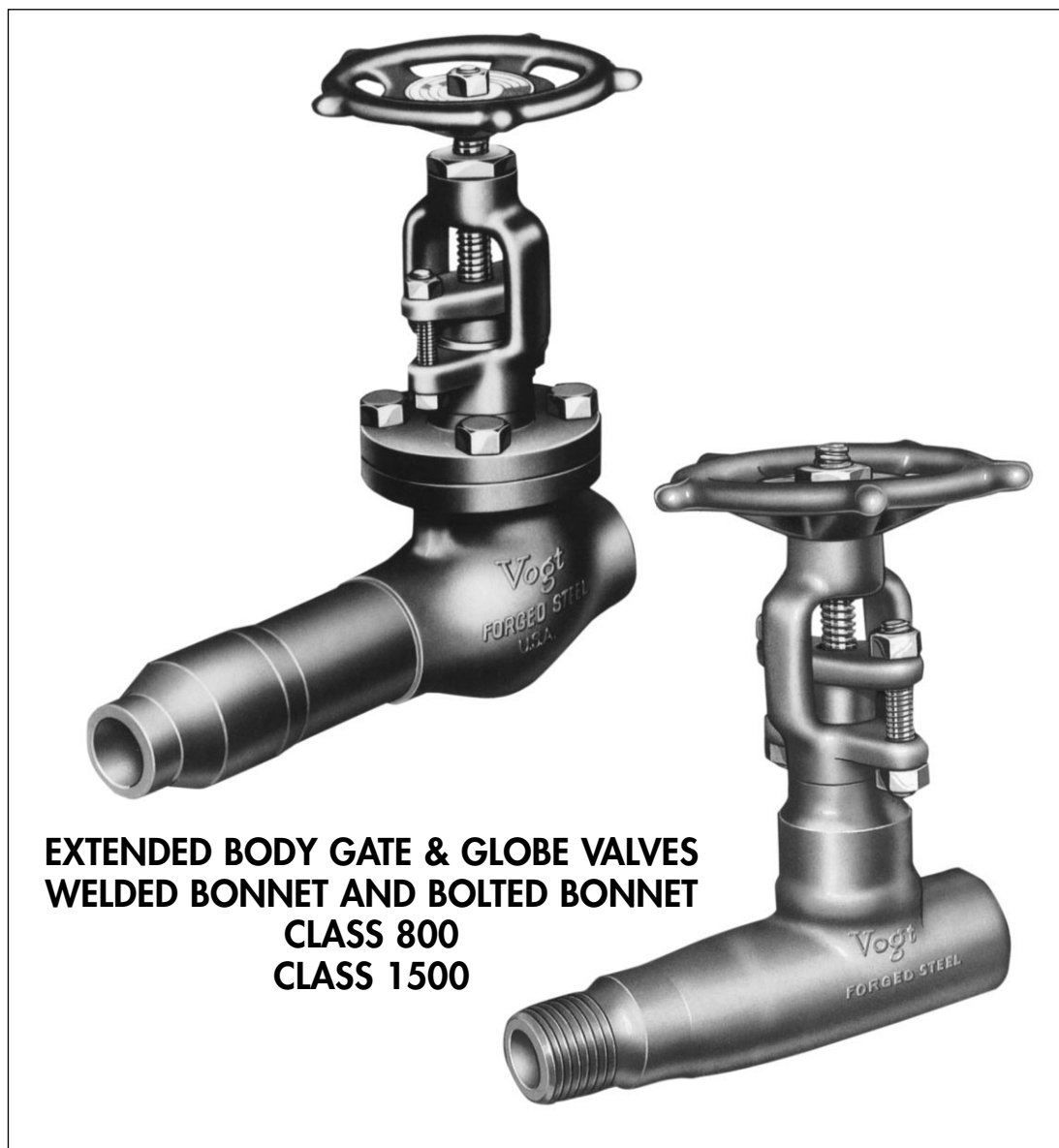
EXTENDED BODY GATE & GLOBE VALVES WELDED BONNET AND BOLTED BONNET CLASS 800 CLASS 1500

An extended body gate valve specifically designed for pressure measurement, venting, draining and sampling applications.